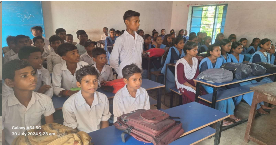
Galaxy A54 5G 30 July 2024 9:23 am