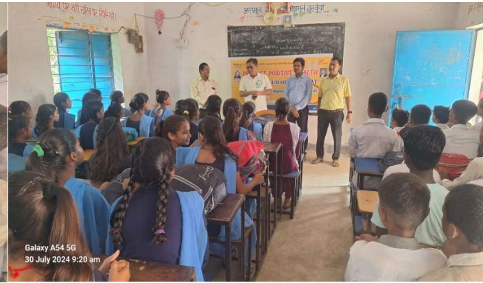
Galaxy A54 5G 30 July 2024 9:20 am