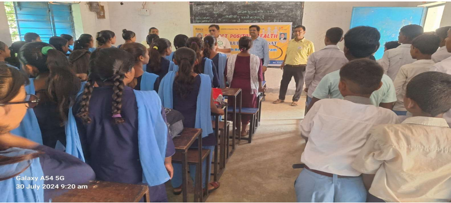
Galaxy A54 5G 30 July 2024 9:20 am