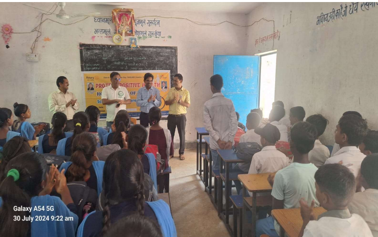
Galaxy A54 5G 30 July 2024 9:22 am