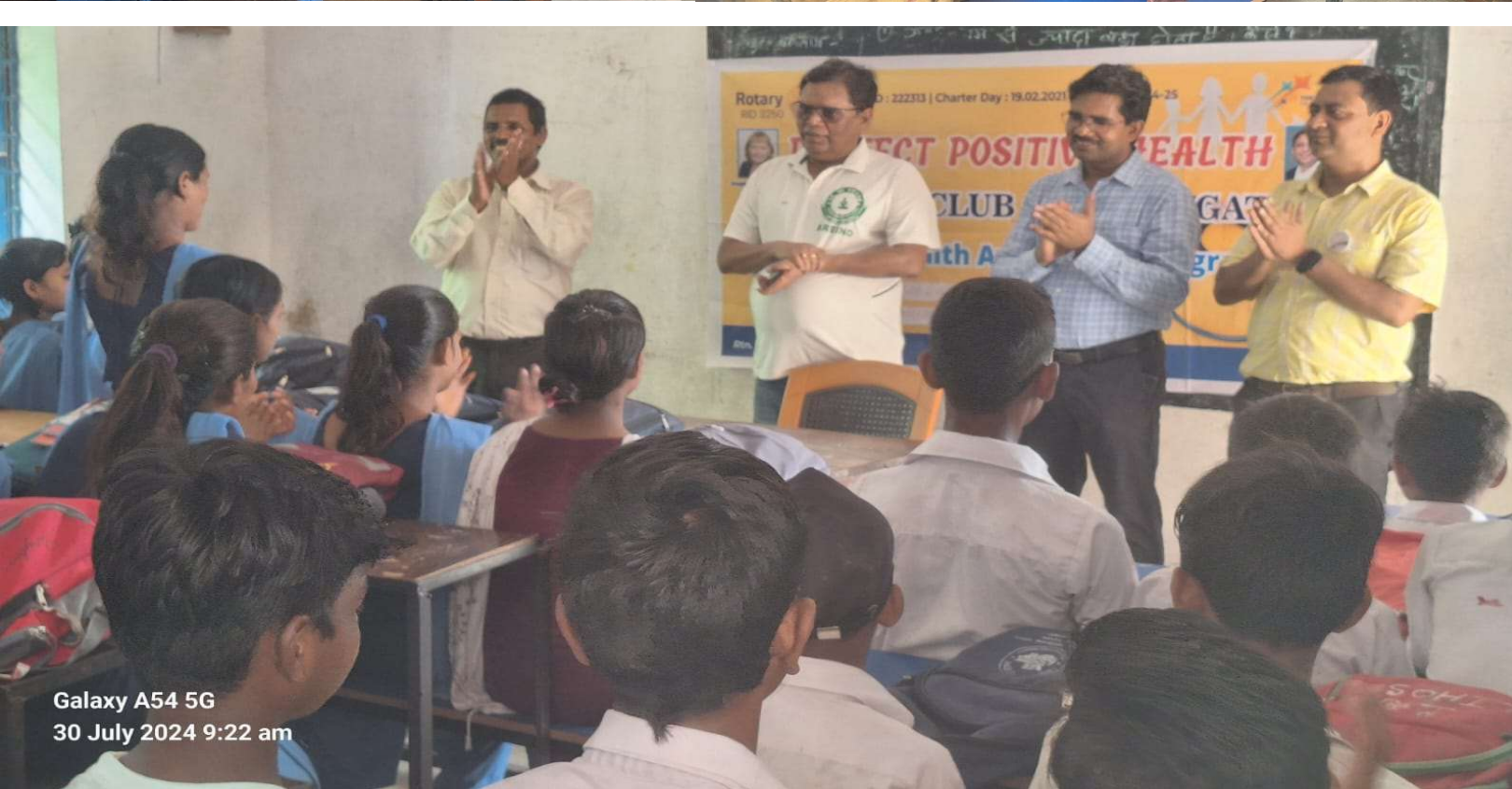
Galaxy A54 5G 30 July 2024 9:22 am